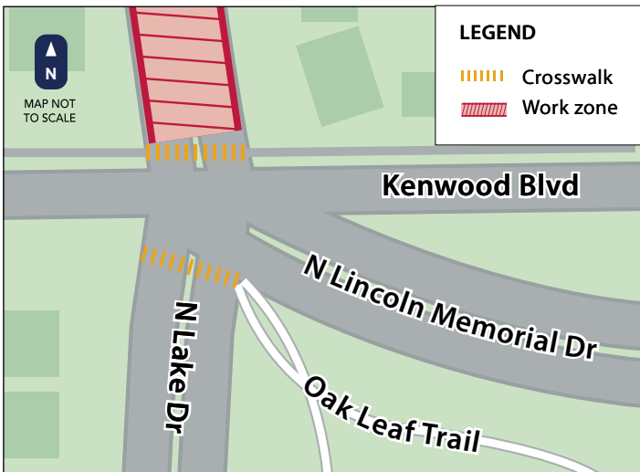
Pedestrian crossing access at Lincoln Memorial Drive intersection during construction.